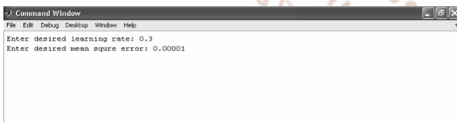
Figure. 4 Command window

After main program has opened, the cover window appears as shown in Figure.2. In this screen, there are two submenus under Main menu. If the user wants to train the data set, the submenu “Train” can be chosen. Otherwise, the submenu “Test” can be chosen if the user want to test. If the user chooses the “Train” menu, the command window appears as in Fig. 4, requesting the user to give desired learning rate and mean square error. Then the training program perform its task (training data set) and outputs the results of total iteration number, total time taken (in seconds), mean squared error and actual output vector as shown in figure.